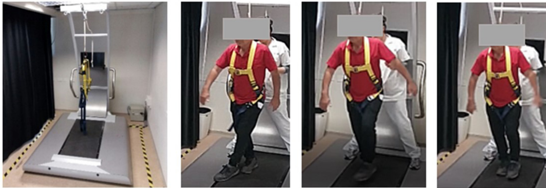
FIGURE 1 | Setup for reactive balance control assessment. On the left is the computerized treadmill system. On the right is a video sequence demonstrating reactive step response to lateral surface translation of a stroke patient with right hemiparesis. A written informed consent was obtained from the individual for the publication of this image.